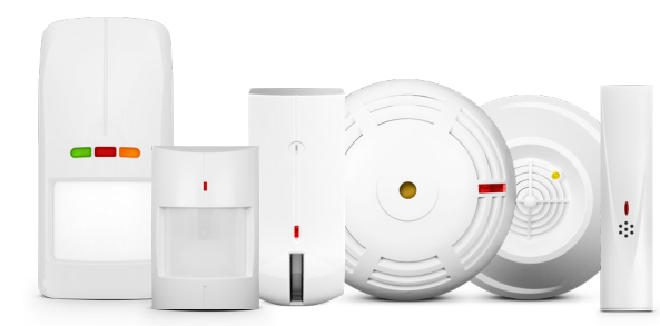
OPAL Pro, TOPAZ Pet, AGATE, ASD-150, DG-1 ME, ATD-100

Based on the INTEGRA alarm control panel, you can create an extensive system of wired or wireless devices (as well as a hybrid installation combining both technologies) that will effectively protect the area of even the largest property. Regardless of the advancement level of the solutions used, the system will remain easy to use for every household member.